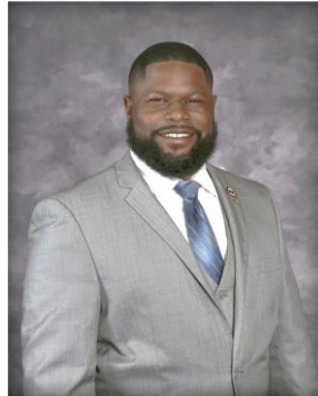
Mayor Malcolm Lilienthal

Mayor Malcolm Lilienthal will speak on his term as Mayor of Hemet and plans for the City of Hemet